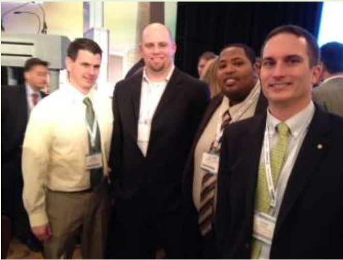
Leadership U participants at the Chicago Winter meeting.