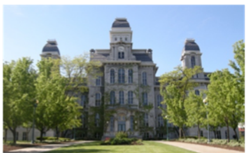
Hall of Languages for Tech Session