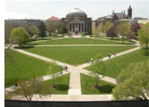
SU Quad for breaks & Lunches

Abstract submission deadline extended until January 31, 2010