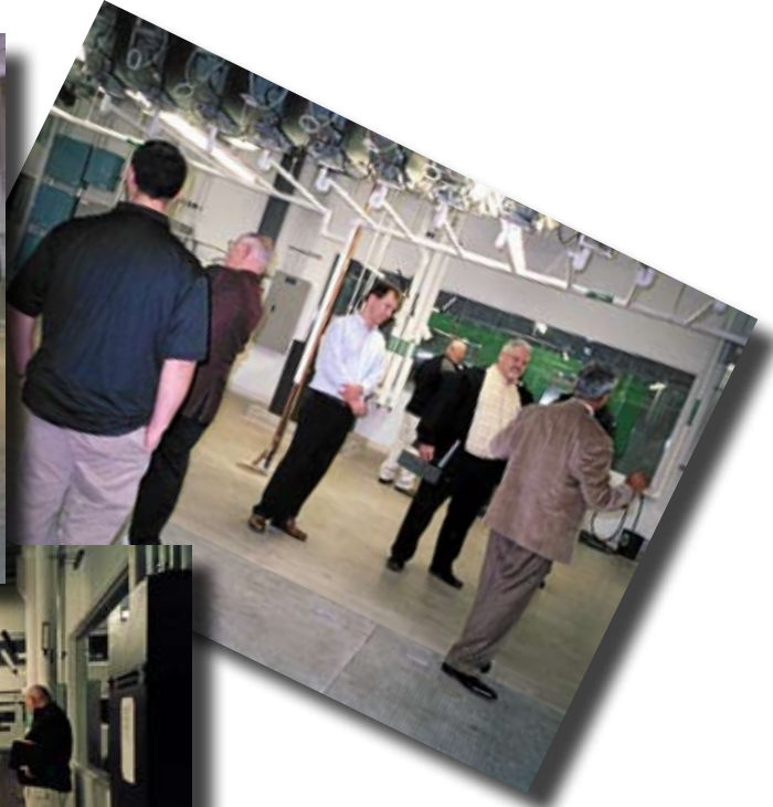
Center of Excellence