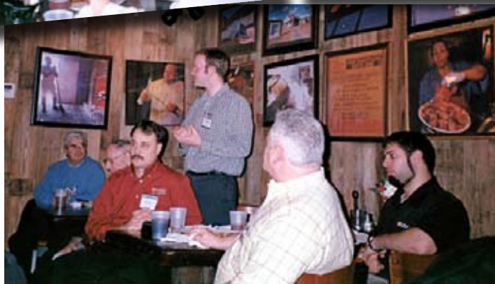
Dinner at Dinosaur BBQ