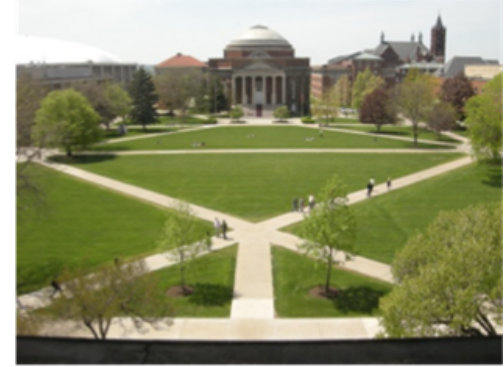
SU Quad for breaks & Lunches

Abstract submission deadline extended until January 31, 2010